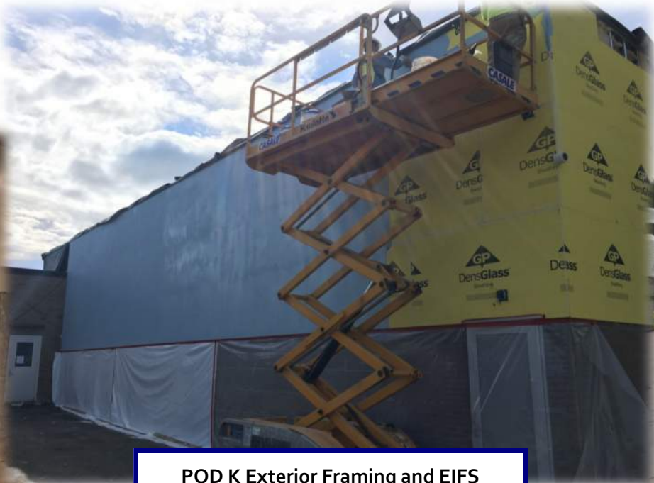
POD K Exterior Framing and EIFS