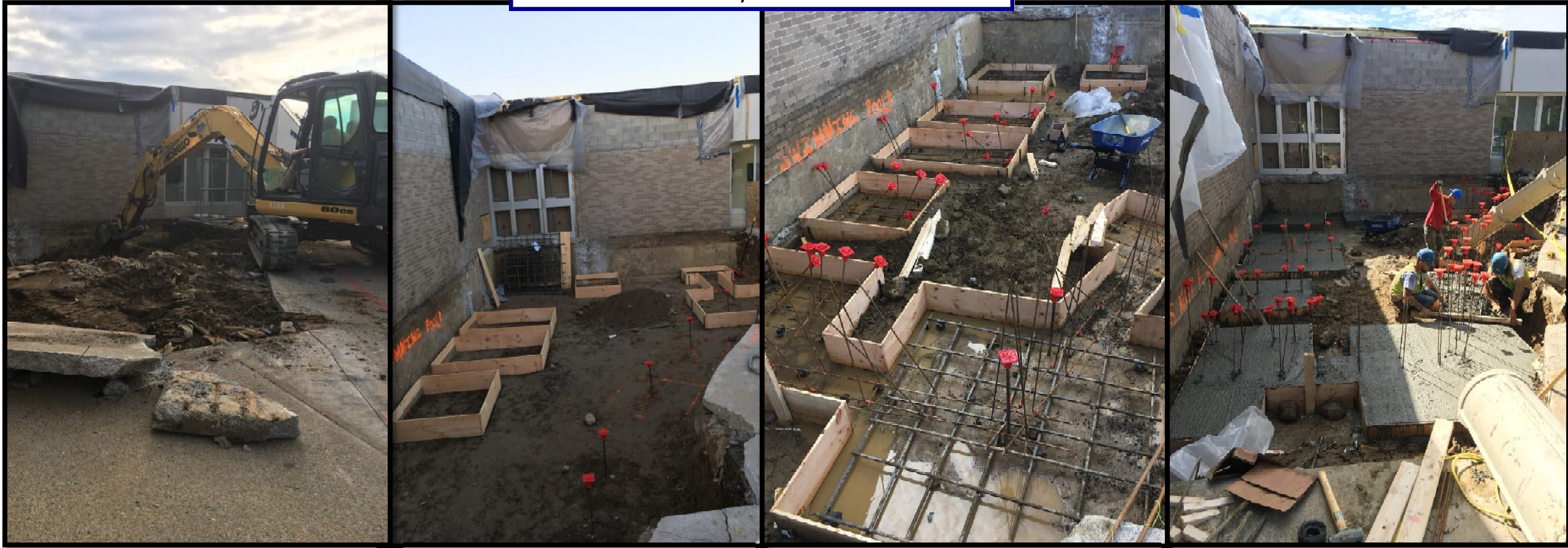
POD J Addition Demolition, Excavation & Foundation Work