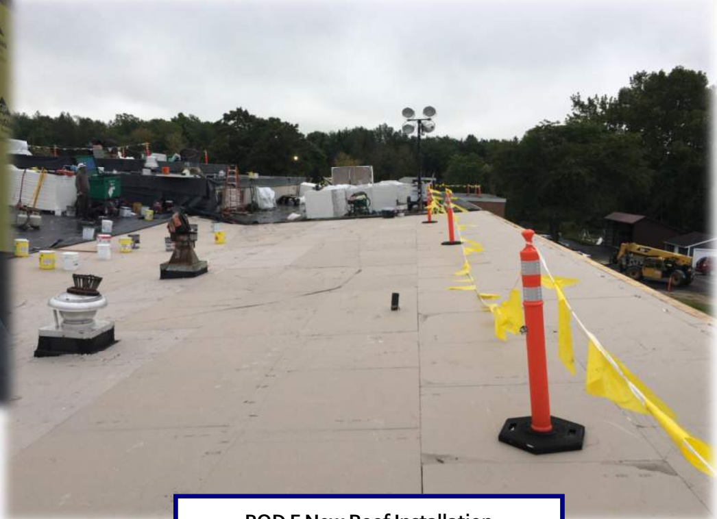
POD F New Roof Installation