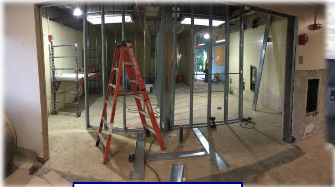
POD K Bathroom Framing